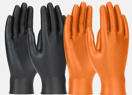
PIP® Grippaz® Skins 67-246 (Black) // 67-256 (Orange) sized S - 2XL