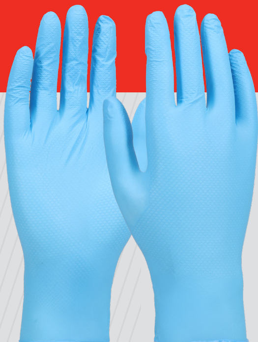
AMBI-DEX® w/ GRIPPАЗ® 66-400 S-2XL